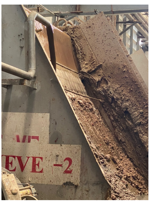
The media going through the valve